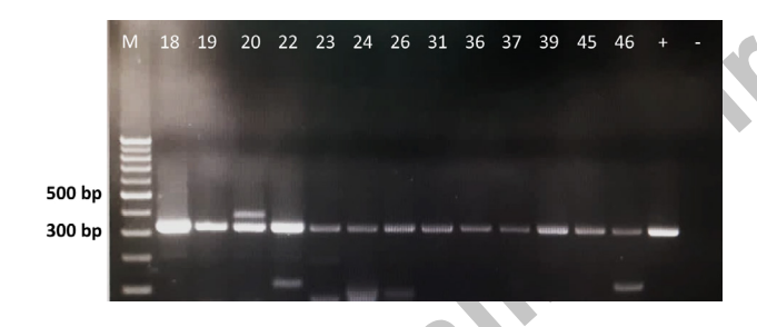
Fig. 1. Leptospira 16S rRNA PCR amplification of bovine kidney samples. M: 1 kb marker, +/- (positive/negative) controls and the Leptospira PCR-positive samples were placed in between M and the controls (Samples no. 18, 19, 20, 22, 23, 24, 26, 31, 36, 37, 39, 45 and 46). L. interrogans serovar Canicola was used as positive control in this study.

From 50 bovine kidney samples collected, 13 (26%) samples were found to be positive via PCR of the Leptospira 16S rRNA gene (Fig. 1). The distribution of the positive samples corresponding to each wet market is tabulated in Table III.